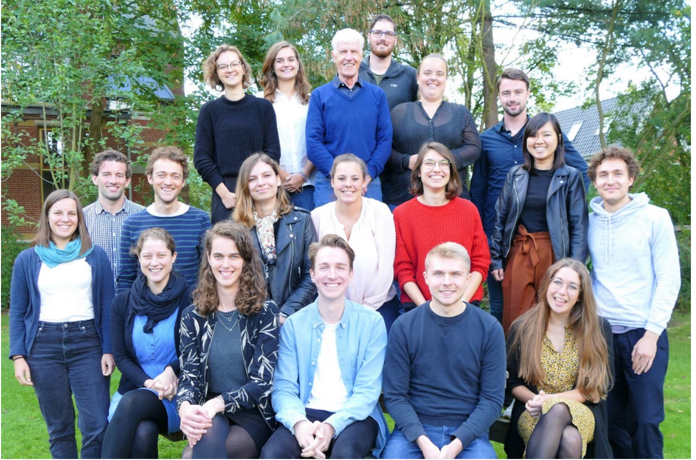
The PhD students of year group 2019