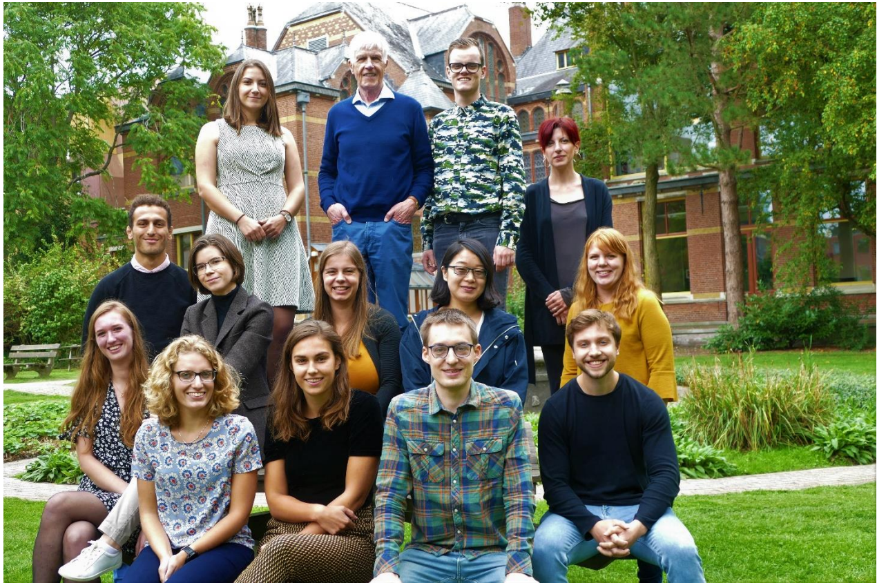
The PhD students of year group 2018